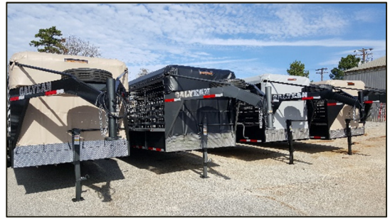
18oz Tarps in Multiple Colors, Front and Top