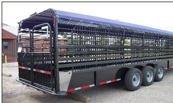
You want something that will hold its value, Well you've found it!