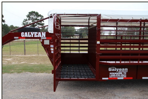
41" Full Escape Door - Can load a saddled horse!