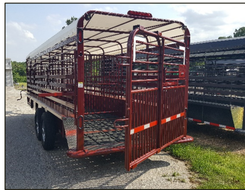
Heavy Duty Butterfly Cattle Gates With 2x4 Tubing Frame and Pipe Latch. Sliding tailgate also available.