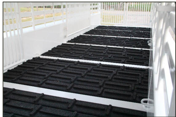
Flooring available in X-Lug Cleated Rubber