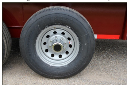
235/85R16 14ply All Steel