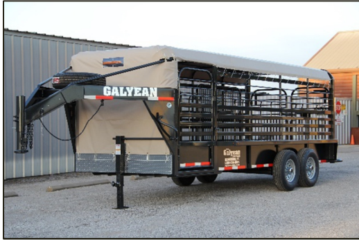
Torsion Axles Standard