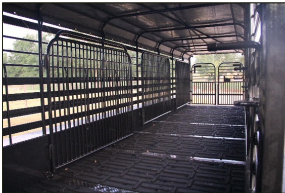
Movable Cut Gates