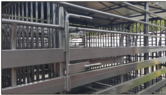
Easy Open Slam Latch Handles on each Gate Position