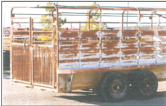
This stock trailer has not weathered well.

JUST TWO THINGS - The attention to detail is remarkable, right down to the grease zerks on the latch receiver. But the two most important features of our trailers are the uni-body FRAME and the FINISH.