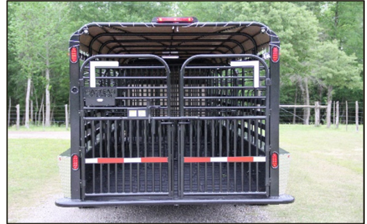
Heavy Duty 2x4 Tubing Uprights with Quad Tail Lights (Reverse lights also available)