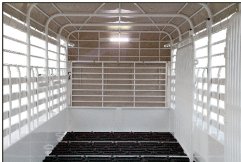
Optional LED Dome Light in Nose with Toggle switch on Neck