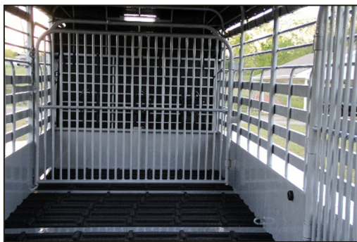
Heavy Duty Cut Gates are Standard! Dog Gate or Slide Cut Gates Optional.