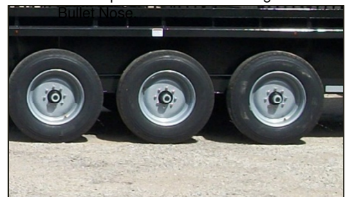
215/75R17.5 16ply All Steel 235/75R17.5 or 18ply All Steel Optional