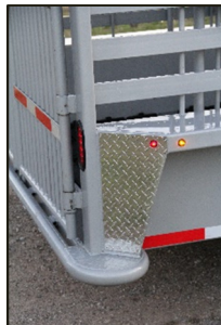
Aluminum Diamond Plate Gravel Guard Front & Rear!