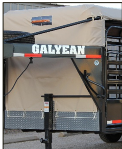
Aluminum Diamond Plate Gravel Guard Front & Rear!